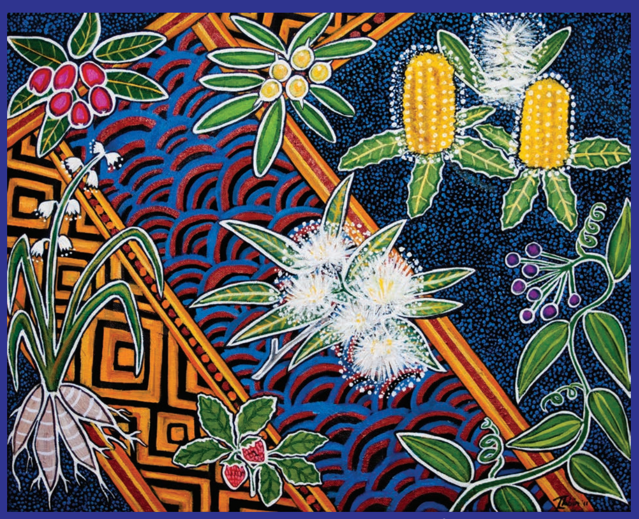
"Healing Country" - Leanne Tobin, Darug 2011

Blue Mountains Aboriginal Sharing and Learning Circle Report